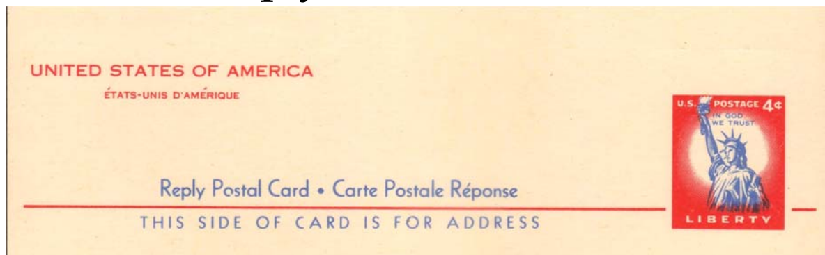
1956 US Postal Reply Card

message on the message card, fold it, and then mail it. The recipient would detach the reply card, address and write a message on it, and then mail it to the initiator.